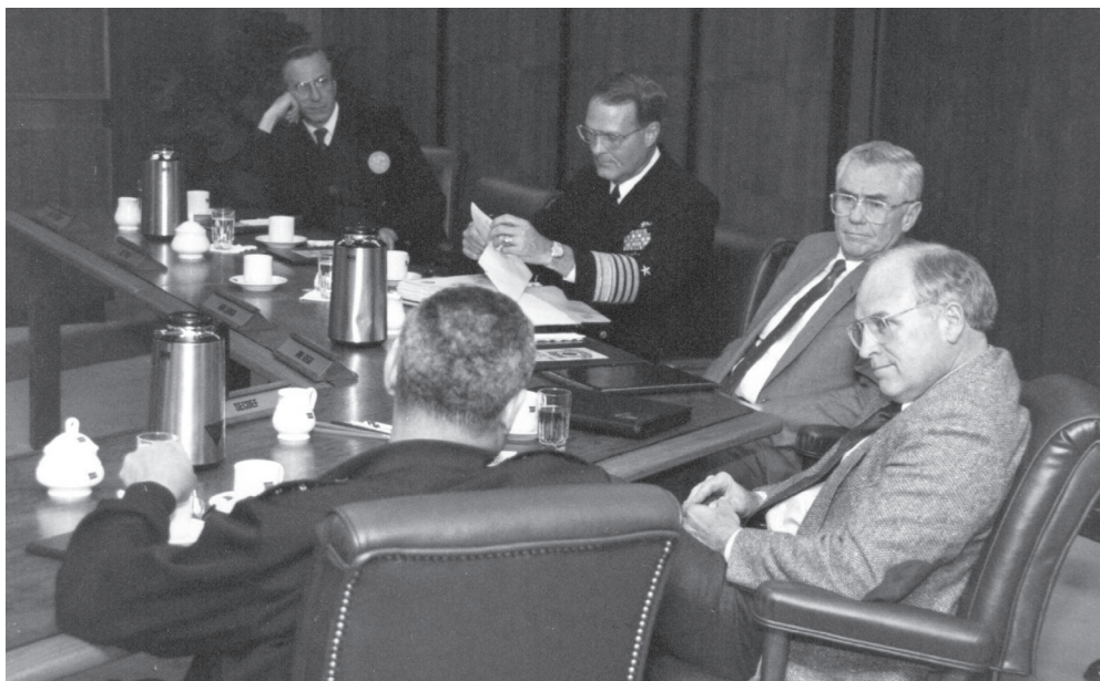
Meeting with (counter-clockwise) Joint Chief of Staff Chairman Colin Powell, Secretary of Defense Dick Cheney, Ambassador Donald P. Gregg, and Admiral Charles R. Larson in Seoul 1992.

In August, Kim Dae-jung was in Japan and continued his direct attacks on Park and the Yushin system. On August 8, Kim was kidnapped from his Tokyo hotel room. Ambassador Philip Habib in Seoul called me into his office and said, "I know how things work around here. They plan to kill Kim, but if you can tell me by tomorrow morning who has him and where