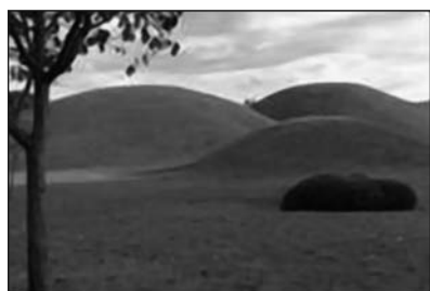
PBS Hidden Korea. http://www.pbs.org/hiddenkorea/history.htm .