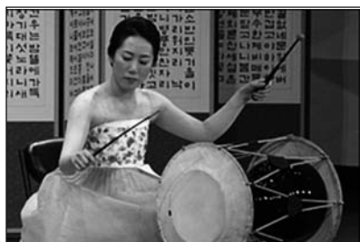
Korea Society—K12 Resources. http://www.koreasociety.org/arts/performing_arts/rhythms_to_make_the_heart_beat_faster.html .