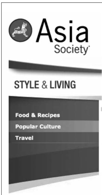
Asia Society Website banner. http://www.asiasociety.org/style-living/contemporary-youth-culture-korea

In addition to a description of the geography of Korea, the climate, the natural resources, and the population are discussed. For a brief view of Korea before the twentieth century, and then after the Korean War, there is a related article here: http://www.asiasociety.org/countries-history/traditions/korean-history-and-political-geography . ■